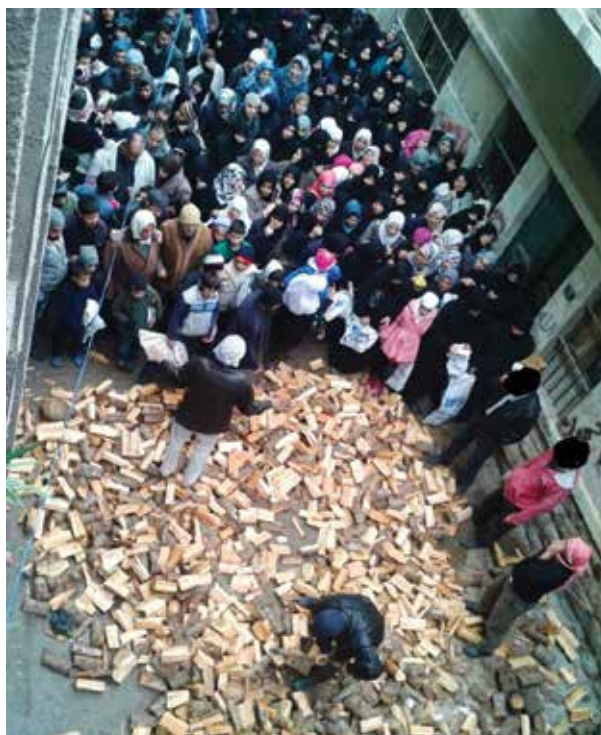
Above: Women gather at a firewood distribution point in southern Syria. Opposite Page: Men watching over children at a collective center for Syrian refugees in Saida, Lebanon, where CARE has provided families with cash assistance.