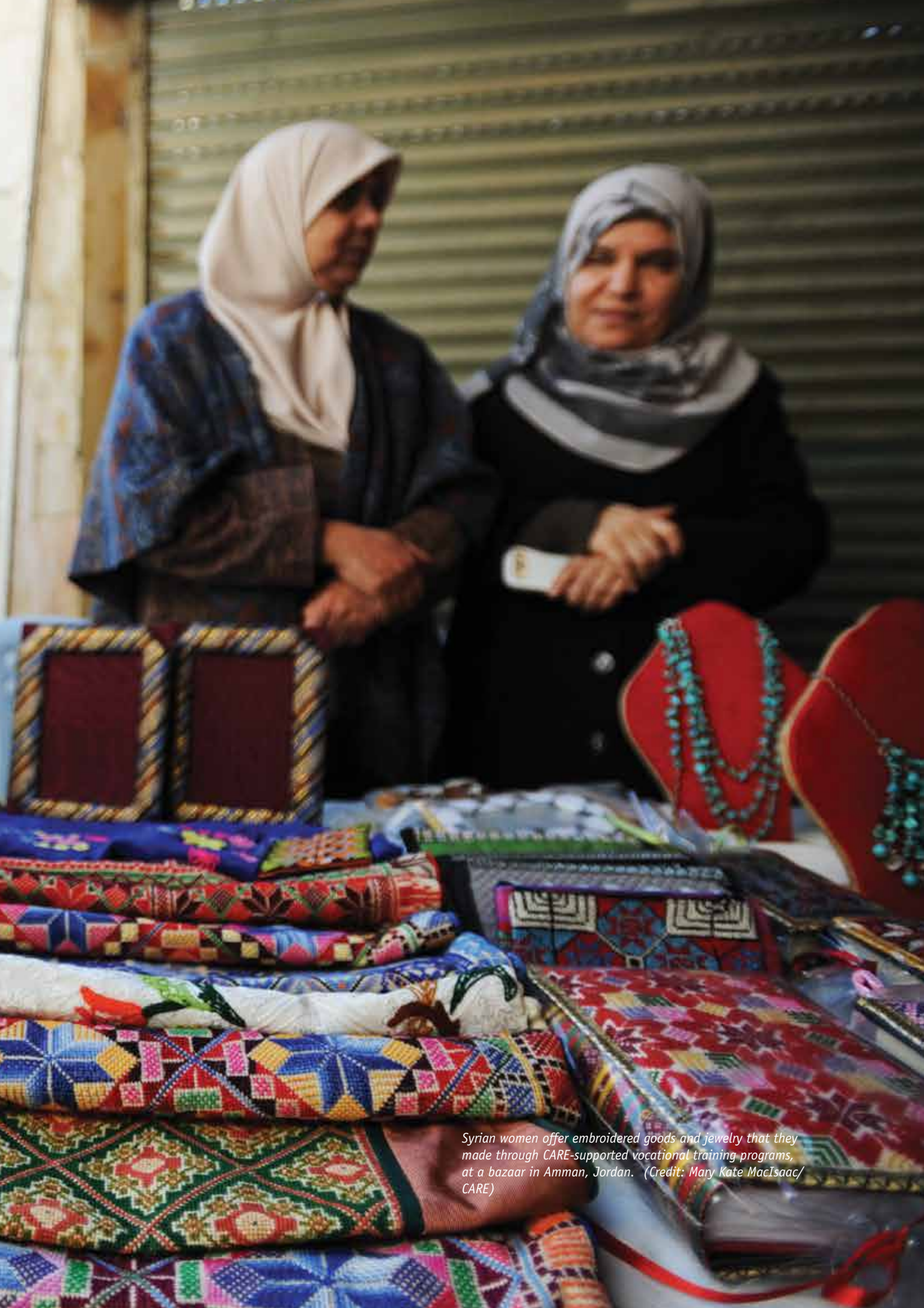
Syrian women offer embroidered goods and jewelry that they made through CARE-supported vocational training programs, at a bazaar in Amman, Jordan.